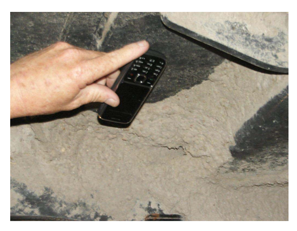
7. Front wheel arch RHS