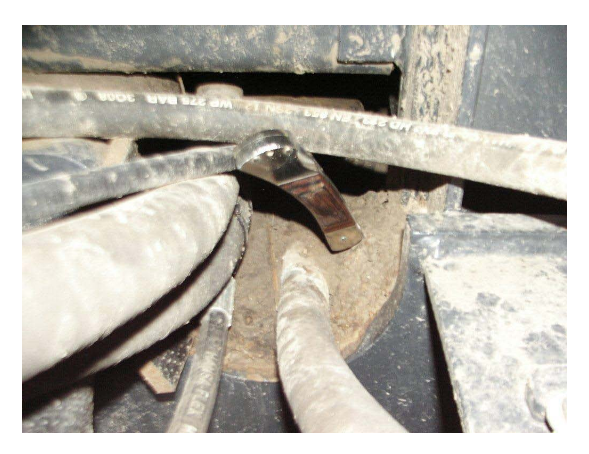
5. Engine bay