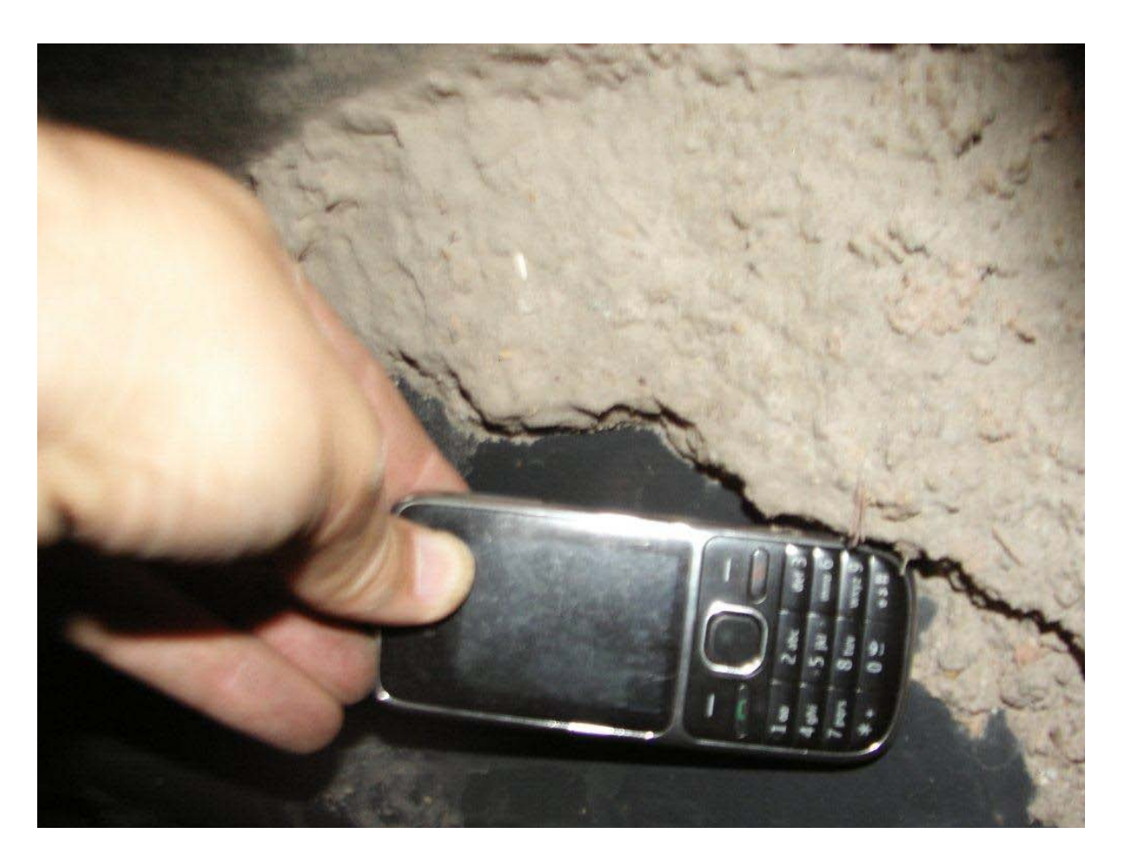
3. Rear wheel arch