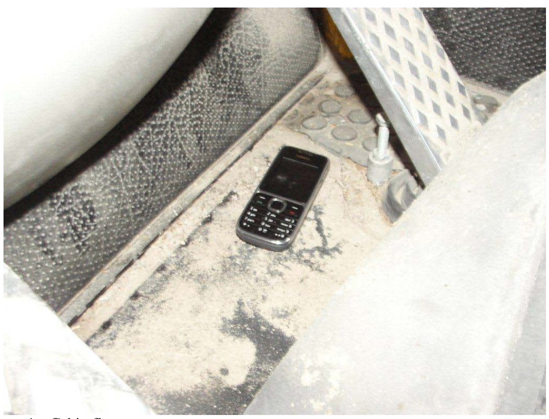
4. Cabin floor