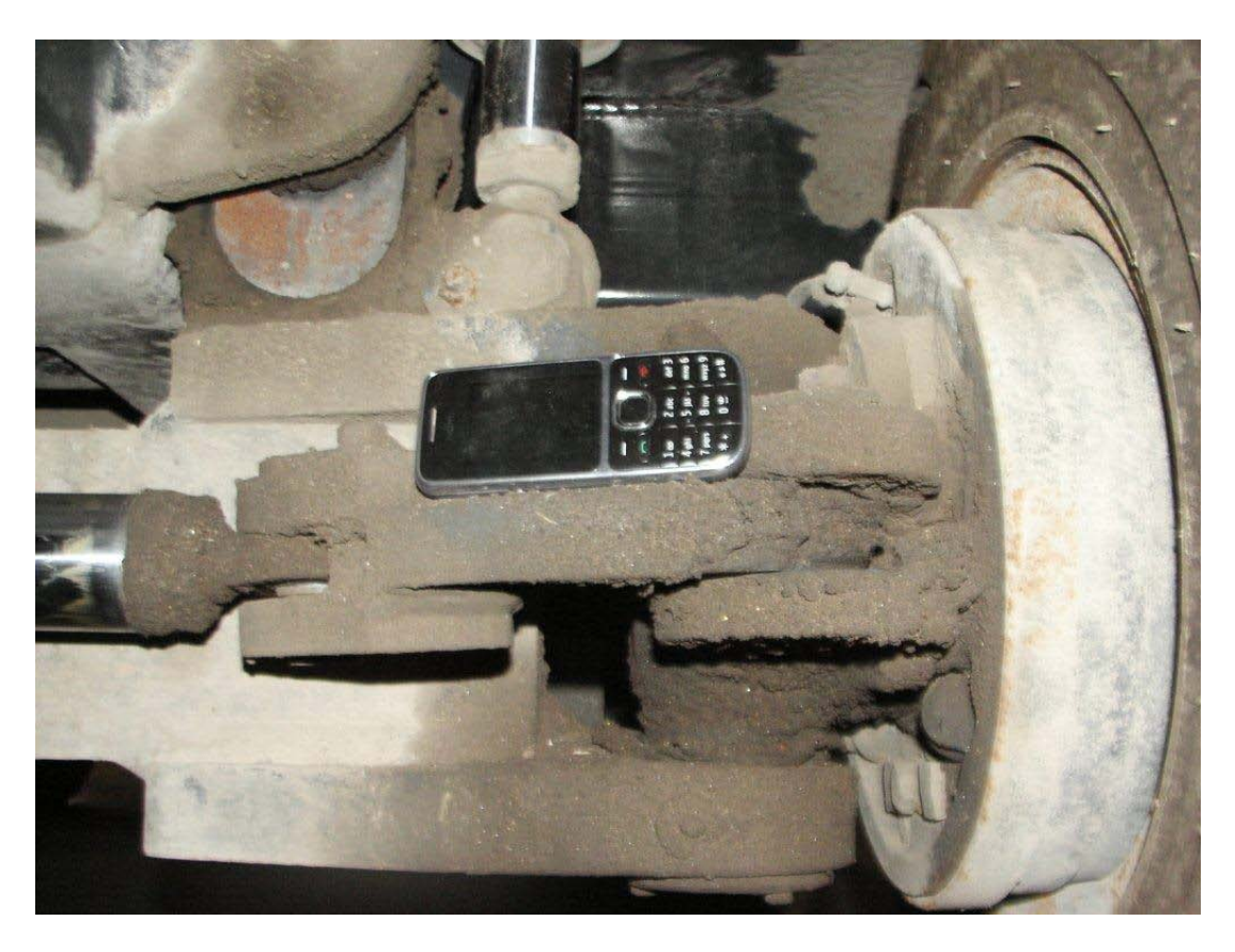
6. Front wheel arch LHS